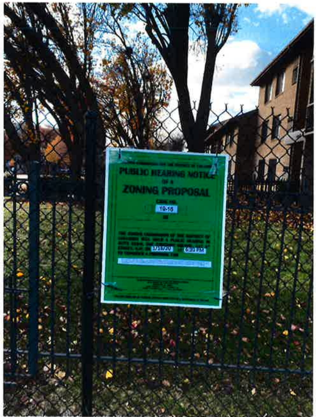
12/5/19 – N Street NW