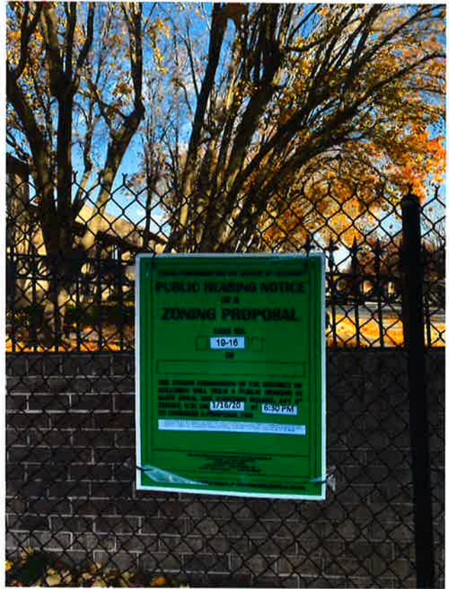
12/5/19 – M Street NW