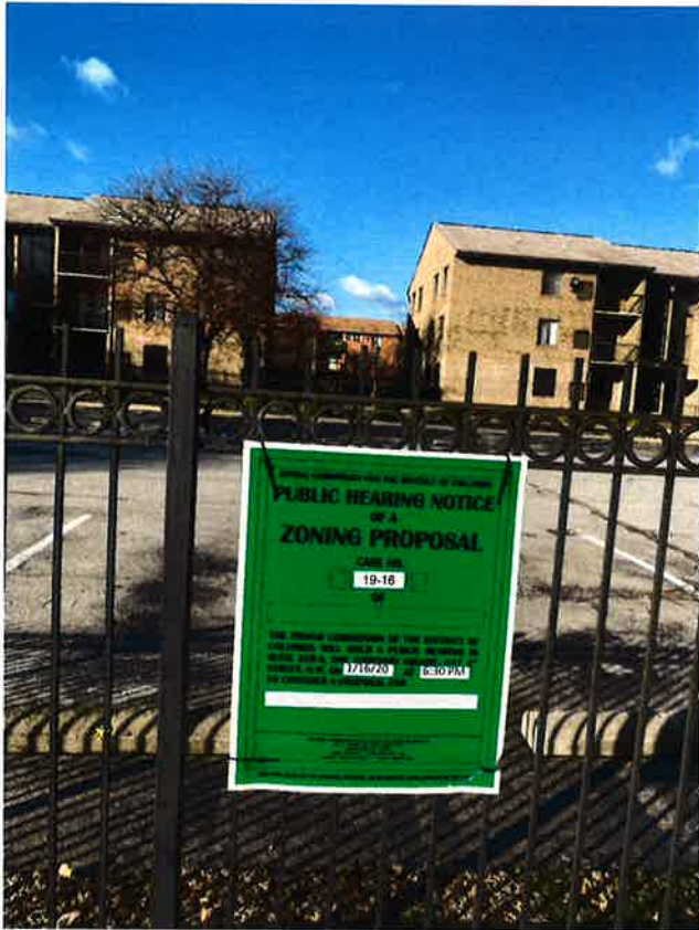
12/5/19 – 5 th Street NW