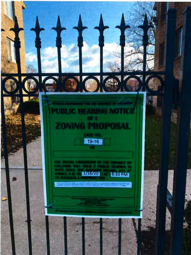
12/5/19 – 6 th Street NW